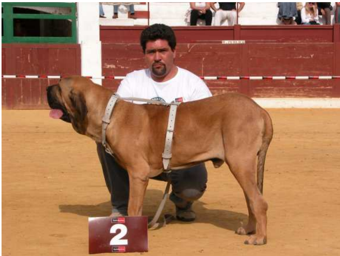
Cacique de Puerta Oscura