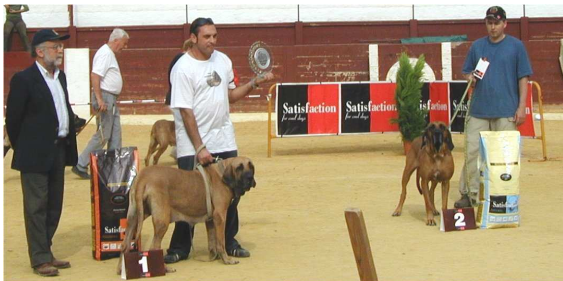
Best Head 1° Faceira del Tamajon, 2° Queimada de los Tres Naranjos

The best female was without any doubt Faceira del Tamajón and under big applause from the fileiros she was declared Best in Show.