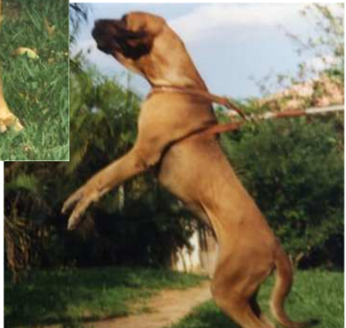
Condor II de Jawa