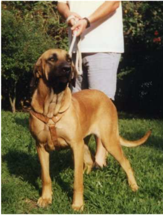
Xambira do Parque do Castelo