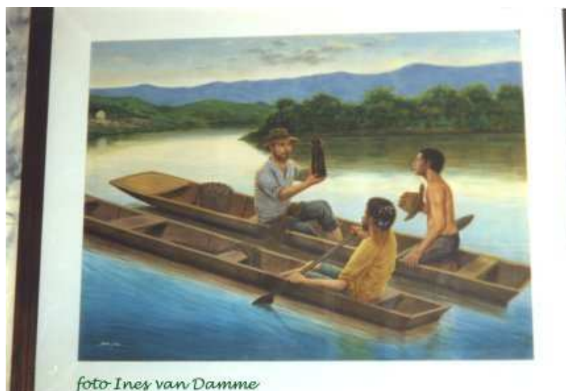
Image of three fishermen finding a small statue of the Virgin in the Paraíba River

In spite of being the place where we find Brazils National Sanctuary, Aparecida can hardly be found in the travel guides. In the year 1717 some fisherman found a small clay statue of the Virgin Mary, only 35 cm. high in the waters of the Paraíba River. Soon the place of Aparecida developed into an important pilgrimage town.