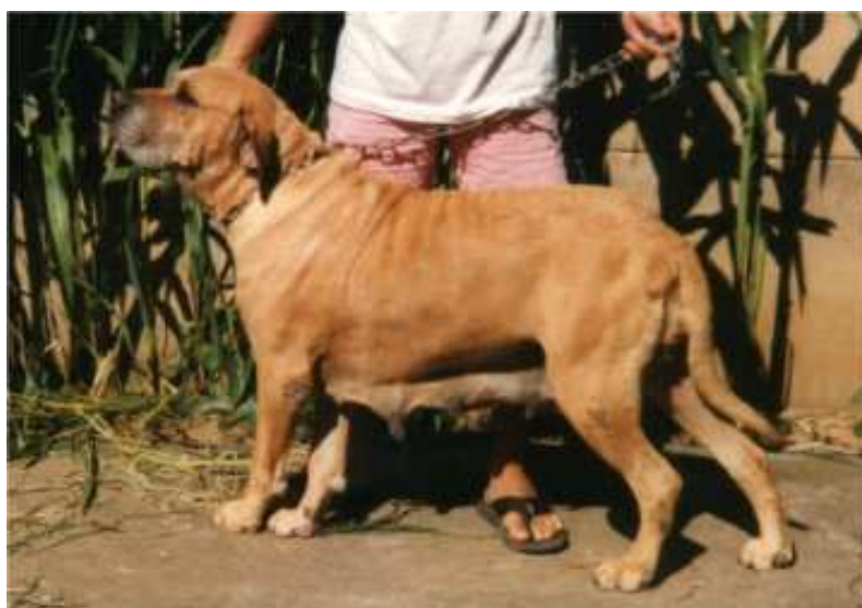
Brisa de Jawa (Scorpion do Ibituruna x Iris do Tangará – Açú)