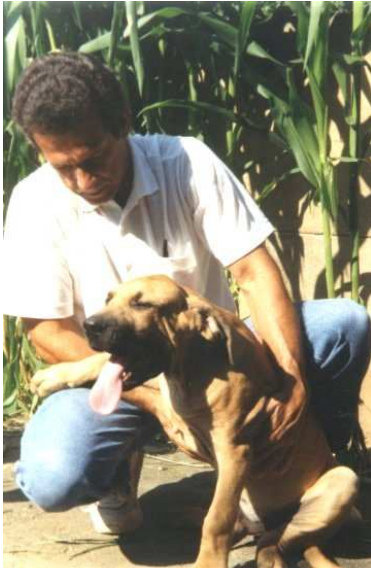
Hercules de Jawa (Phanton de Jawa x Orca de Jawa)

Without any doubt we can say that the most famous “de Jawa” Fila is INFANTE, a nice yellow male with a deep black muzzle, and famous for his actuations in temperament tests. He was CAFIB Temperament Champion in 1993, 1994 and 1995.