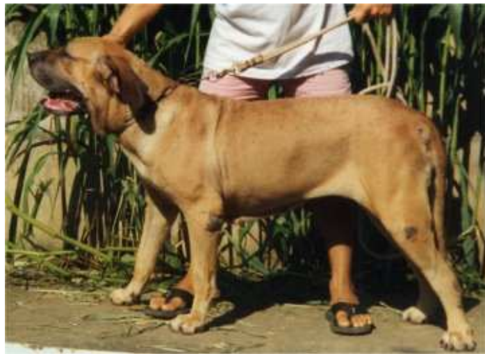
Juma de Jawa (Scorpion do Ibituruna x Iris do Tangaré – Açu)