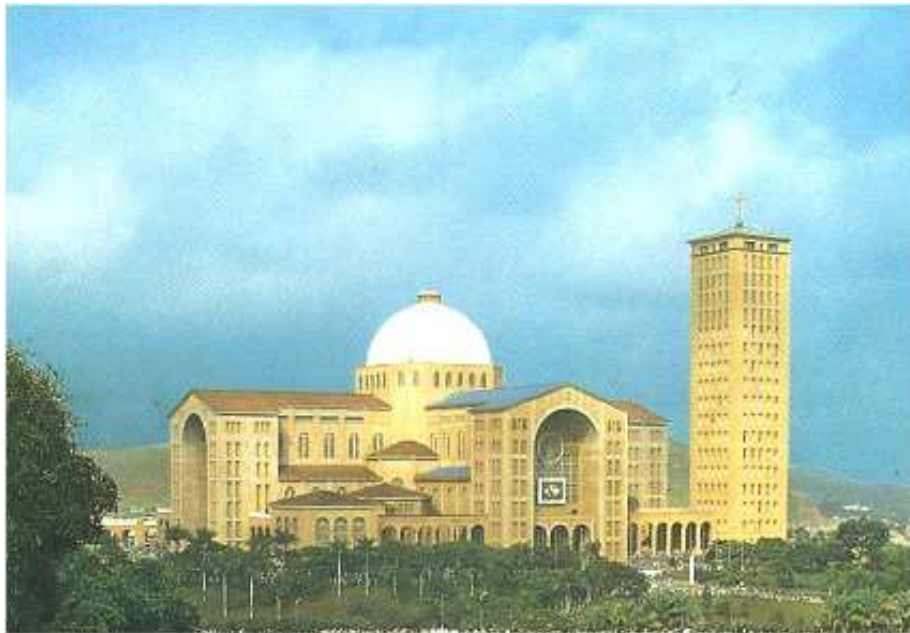
Santuário Nacional Nossa Senhora da Conceição Aparecida

In 1955 started the construction of the modern cathedral that dominates the surroundings of the town. The church was consecrated in 1980 by Pope John Paul II and in 1984 declared officially National Sanctuary by the bishops of Brazil. The cathedral can accommodate 45.000 persons while 200.000 pilgrims visit the “Santuário Nacional Nossa Senhora da Conceição Aparecida” every year on October 12, the national feast-day. I had the possibility to visit the Cathedral with the local Fila friends and was impressed by this modern monument, which is not on the top list of travel agencies, but absolutely a worthwhile excursion.