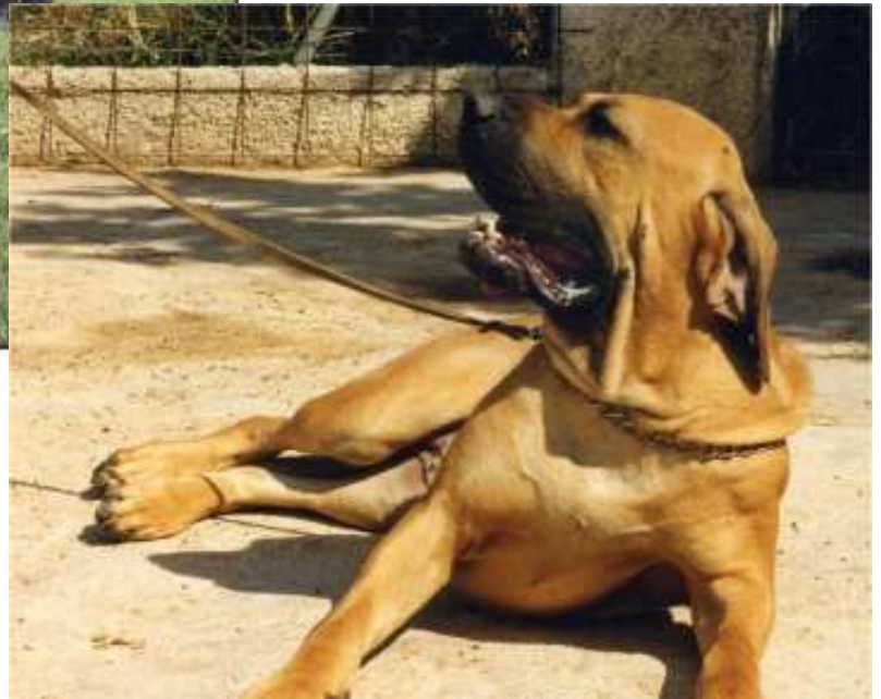
Deusa de Jawa

Garoa de Jawa had three Los Tres Naranjos litters; F2 with Gameleira Tororó das Gerais, I2 with Guerreiro do Itapuã and S2 with Garimpeiro de Los Tres Naranjos. The I litter (father Guerreiro do Itapuã) was absolutely the best one and gave us Iris, Iracema and Idalgo de Los Tres Naranjos.