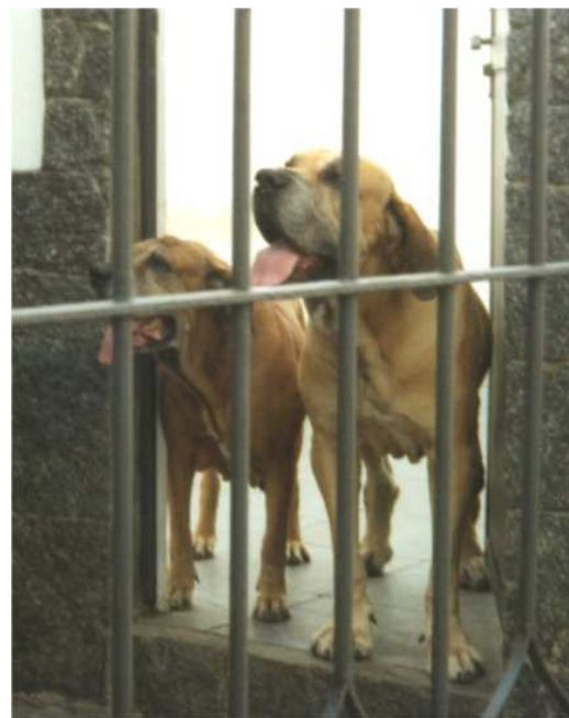
Scorpion do Ibituruna – Iris do Tangará - Açu