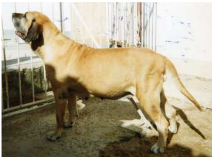
Andra de Jawa