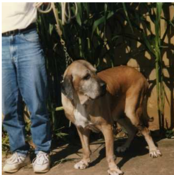
Buana de Jawa (Hercules x Luana de Jawa)

I took the following pictures when I visited Guaratinguetá in 1996. Walter’s house is situated in a street in town and has a rather small back garden with some kennels where I found these Filas: