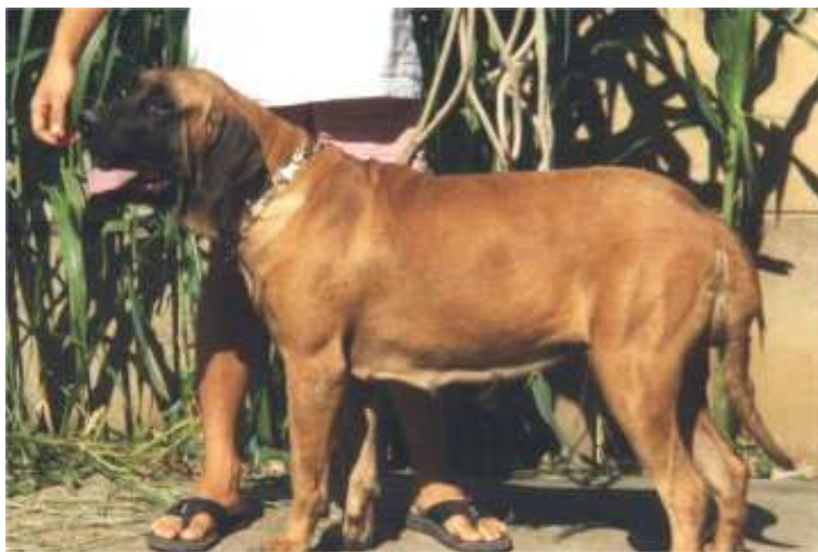
Juma do Hisama (Infante de Jawa x Fauna do Hisama)