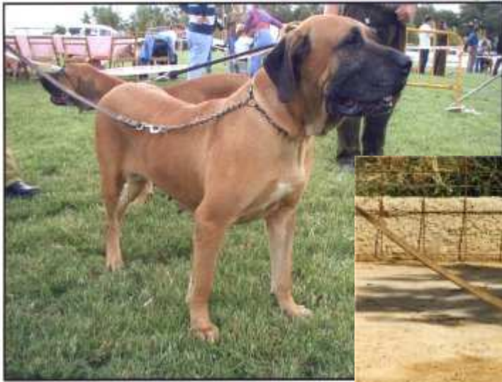
Duna II de Jawa