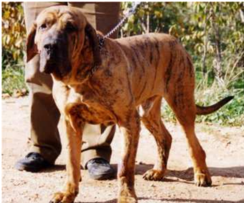
Guarani de Jawa