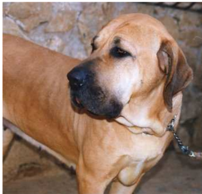
Garoa de Jawa

Garoa de Jawa had three Los Tres Naranjos litters; F2 with Gameleira Tororó das Gerais, I2 with Guerreiro do Itapuã and S2 with Garimpeiro de Los Tres Naranjos. The I litter (father Guerreiro do Itapuã) was absolutely the best one and gave us Iris, Iracema and Idalgo de Los Tres Naranjos.