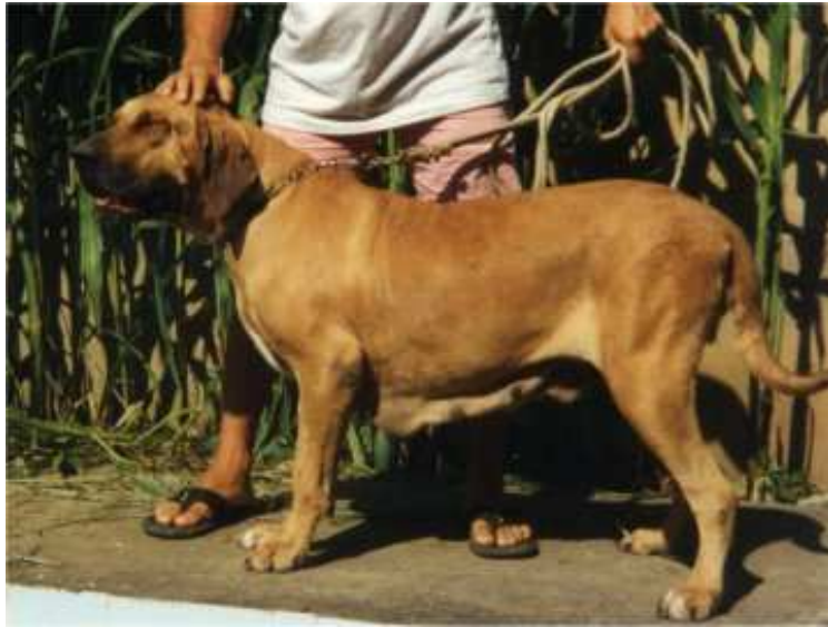
Bethânia de Jawa